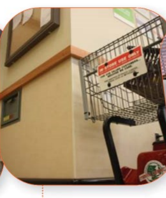
GROCERY STORE SCATTERED STONE