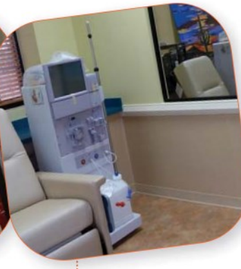
HEALTH CARE CAMEL CANVAS