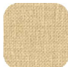
Corn Silk Canvas