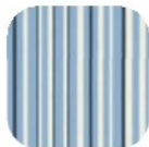
Piri Blue Stripe

Patterns and colors are a representation and may not accurately reflect the final product. Please obtain a sample of the product before making a final selection at www.FRPSamples.com